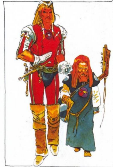
GURNEY HALLECK, warrior and troubadour, Duke LETO's friend.