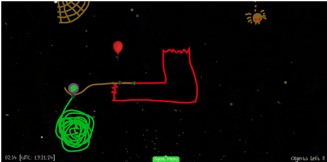
Figure 1: Physics Playground gameplay screenshot. A scoop with a weight attached is being used to catapult the green ball towards the red balloon.

To better describe player typologies as a function of overall behaviors, data were aggregated such that one row of data represented the complete actions of one player across all levels. We included or excluded particular variables from the model according to two criteria: