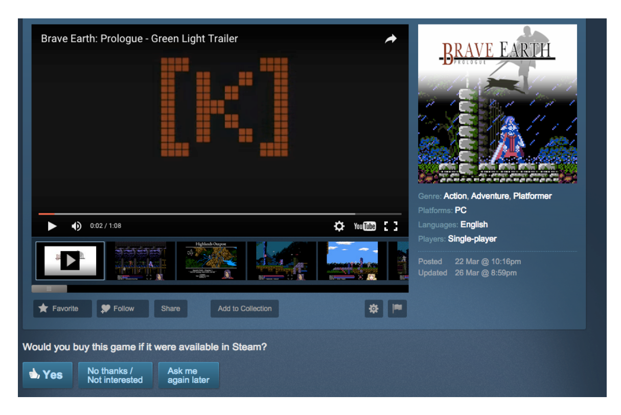
Figure 2: Greenlight example taken from Steam, March 28, 2016.

Yet there are no hard and fast rules for how many up votes a game must receive or how long that process might take. In late 2015 koobazaur reported "we've been hearing that Greenlight is on the decline for quite some time and I think there is no double about that. ... I just started a Greenlight for my second game and ... I was actually taken aback by how rapid the decline actually is," going on to show voting counts to back his assertion.<sup>22</sup>